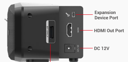
Bluetooth® Dongle Port